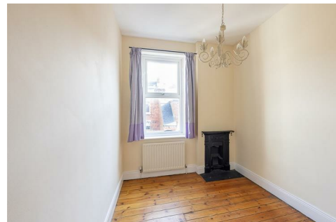
GROUND FLOOR 71 sq.ft. (6.6 sq.m.) approx.

IMPORTANT NOTE: These particulars and the descriptions and measurements herein do not constitute representation and whilst every effort has been made to ensure accuracy, this cannot be guaranteed.